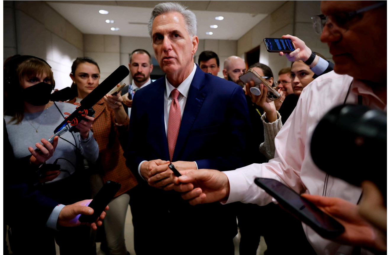
Kevin McCarthy (CA-20) Speaker?

TBD – Chief Deputy Whip, Deputy Whips, Policy Committee