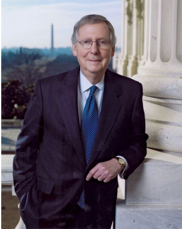
Minority Leader Senator Schumer (R-KY)