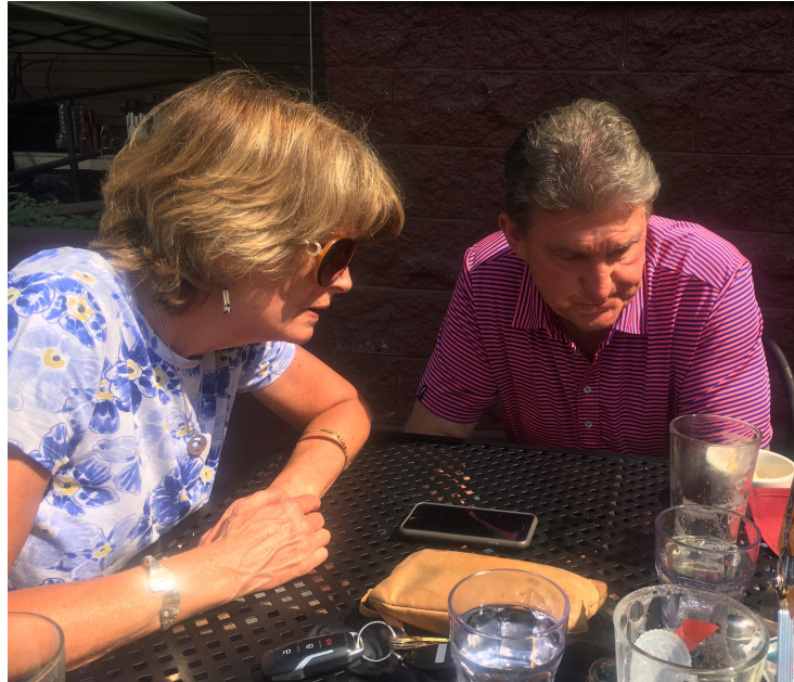
Sen. Murkowski Sen. Collins