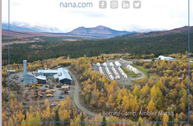
Bornite Camp, Ambler Metals