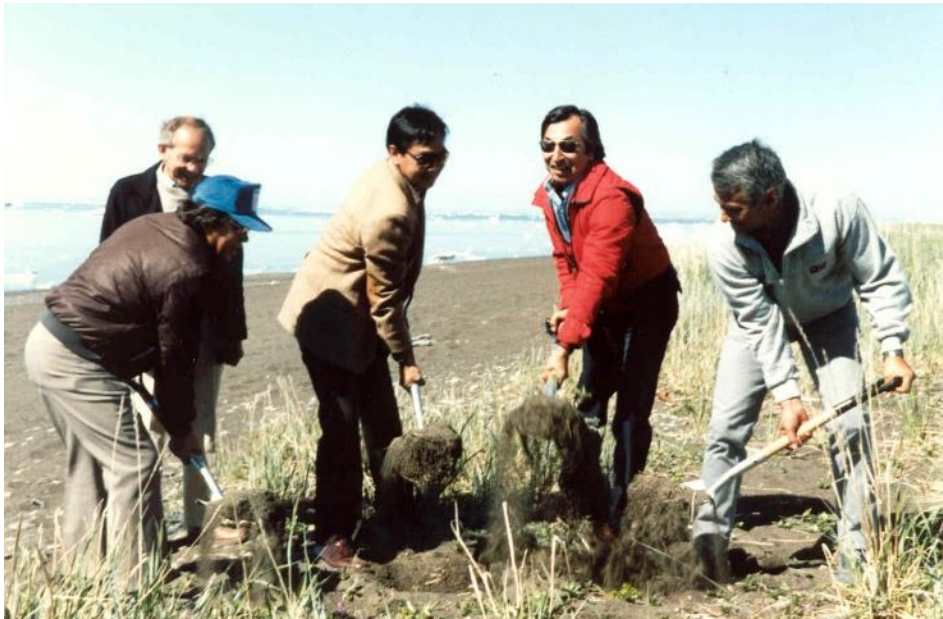
Red Dog Then