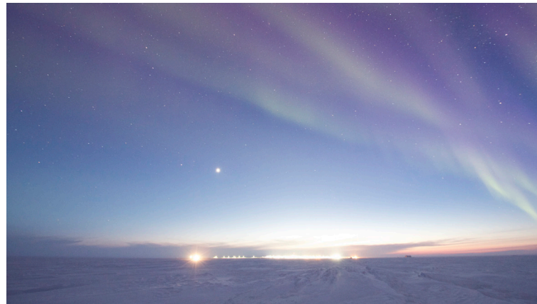
The Aurora shimmers over Kaktovik on the edge of the coastal plain of ANWR. Most residents of the North Slope and Kaktovik support oil development on the coastal plain.

In the other lawsuit, the Gwich'in Steering Committee and 12 other groups allege the Bureau of Land Management violated several laws, including the