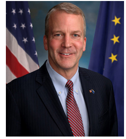
Keynote Address U.S. Senator Dan Sullivan