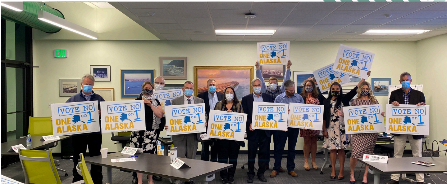
RDC board members attending the association's 45th annual board meeting this summer, urging a no vote on Ballot Measure 1.