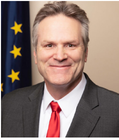
Opening Remarks Governor Mike Dunleavy