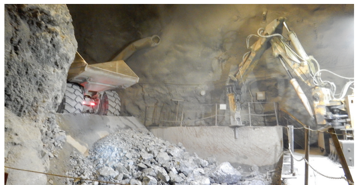
The RDC Board of Directors panned for gold at the Gold Dredge 8 attraction north of Fairbanks (at left) and toured Sumitomo’s Pogo gold mine near Delta. The photo at right was taken underground at Pogo. For more photos on the community outreach tour, please see page 8.