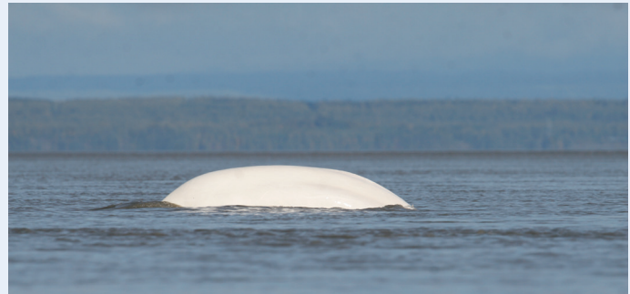
A beluga whale surfaces in Cook Inlet. Unsustainable harvest of the Cook Inlet belugas decimated the population in the 1990s.

RDC acknowledges that population numbers are highly variable, yet when the most current data margin of error is considered, the CIBW population has stabilized between 300 to 400 whales. While the population has not rebounded quickly from the effects of