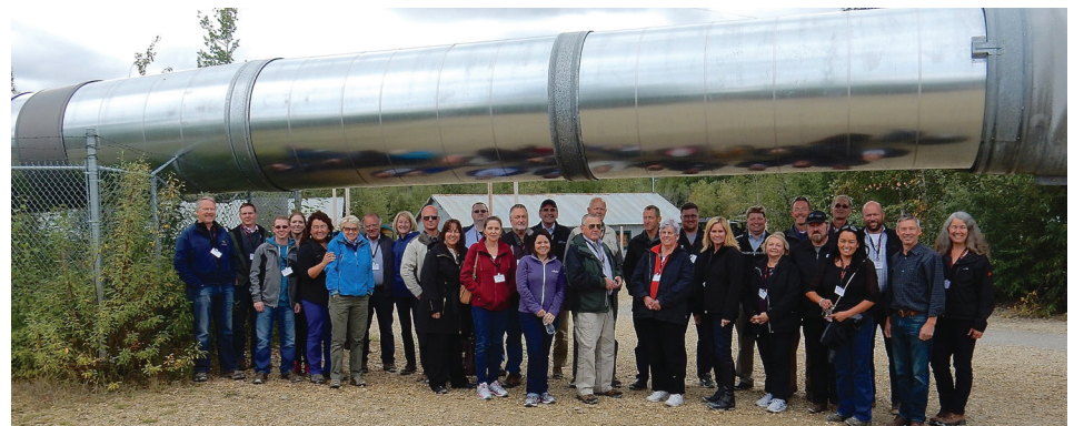
The historic Goldstream Dredge 8 near Fairbanks attracts thousands of tourists each year who tour the site on a train and learn about early mining in the area. Visitors can also tour the dredge and historic buildings on the property. At right RDC board members gather under the Trans-Alaska Pipeline at the entrance to Dredge 8.