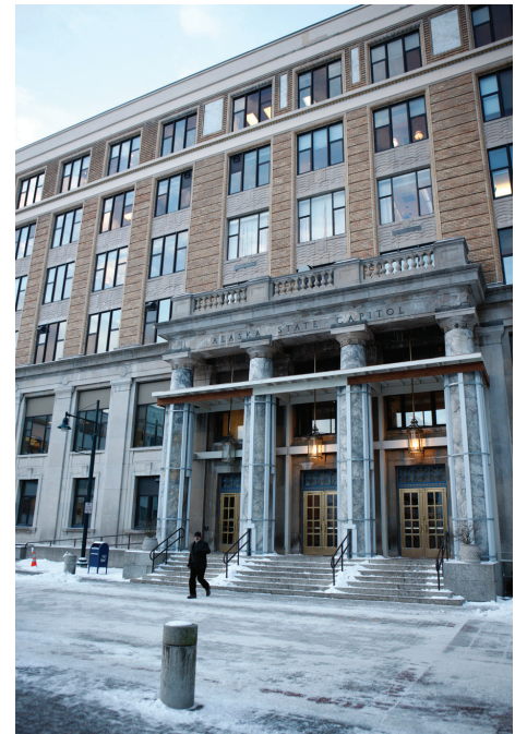
The Alaska State Capitol Building in Juneau.

To achieve fiscal and economic stability, the letter outlines three major priorities of a long-range fiscal plan: reduce spending to an affordable level on a sustainable basis, finance stability by combining revenues with investment earnings to fund essential