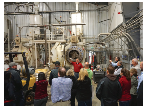
At upper left, RDC board members pose underground at the Sumitomo Metal Mining Pogo gold mine south of Fairbanks. Pogo is an underground mine that has 90 miles of tunnels where the ore is extracted and sent via a conveyor to a sag mill at the surface. In center photo, board members are briefed underground at the Mining and Petroleum Training Service facility near Delta, which develops a skilled workforce to pursue a career in underground and surface mining. At right, RDC visits the Superior Pellet Fuels mill in North Pole.