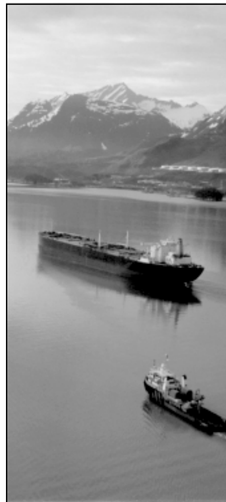
Twenty percent of America's domestic oil production passes through the Port of Valdez.