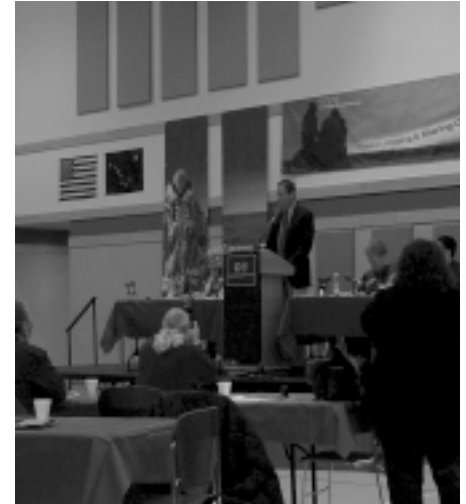
Governor Tony Knowles told summit delegates that the North Slope's resources of oil and gas have made a tremendous contribution to Alaska's economy. His remarks focused on education, transportation and public health/safety.

Development of a stakeholder process for resource/economic projects that takes into account local concerns;