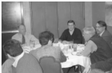
Anchorage Mayor George Wuerch and other RDC Board members meet with Andrew Lundquist on the formation of a new domestic energy policy aimed at reducing America's reliance on foreign oil. The RDC Board met with Lundquist in Anchorage last month.