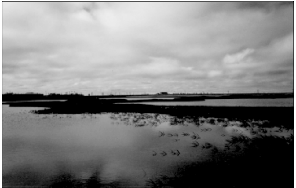
Many wetlands in Alaska are isolated from navigable waters and exist because of permafrost.

Ruling may end Corps' jurisdiction on some wetlands