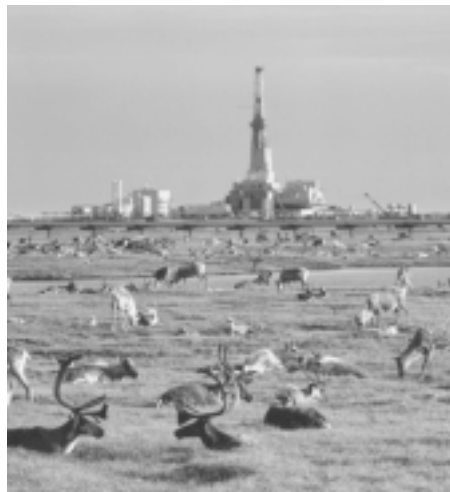
Caribou from the Central Arctic herd graze in the Prudhoe Bay field. According to a recent state survey, herd numbers have increased seven fold since field development began 30 years ago.

In general, caribou herds are doing well across Alaska. Caribou, at over one million strong, outnumber humans in Alaska. The Central Arctic herd has grown more than seven fold since Prudhoe Bay development began in the mid-1970s.