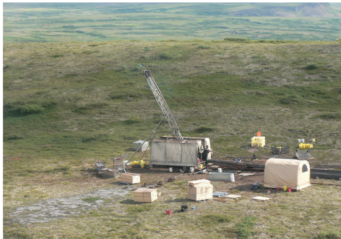
Above is a remote drilling site on the Pebble prospect located on state land open to mineral leasing, approximately 20 miles west of Lake Iliamna in Southwest Alaska.

As Alaska continues to look for ways to attract new jobs and economic activity, we believe the Pebble Project has a valuable role to play. This project represents the potential for billions of dollars of investment, thousands of long-term, high-wage jobs and