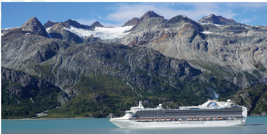
In 2016, 55 percent of visitors to Alaska arrived by cruise ship. More and larger ships are coming to Alaska as demand for Alaska cruises remains high.