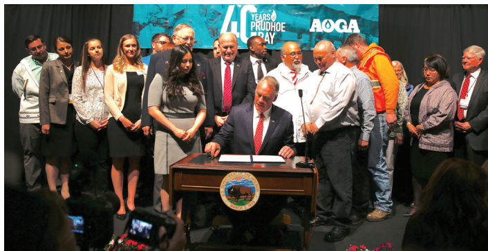
Alaskans join Department of Interior Secretary Ryan Zinke as he signs the secretarial order in Anchorage

Interior Secretary Ryan Zinke issued a secretarial order affirming the Trump administration's commitment to energy development during the Alaska Oil and Gas Association's annual conference in Anchorage on May 31st. The order consists of preparing a schedule for revising the Integrated Activity Plan for the National Petroleum Reserve-Alaska and updating the federal government's assessment of technically recoverable oil and gas resources in the 1002 Area of the Arctic National Wildlife Refuge (ANWR).