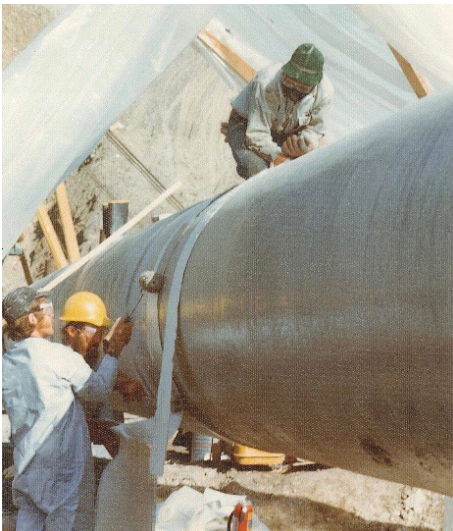
Crew insulates a joint on the pipeline north of the Yukon River in the summer of 1976.

At the time construction began in 1974, TAPS was the largest private construction