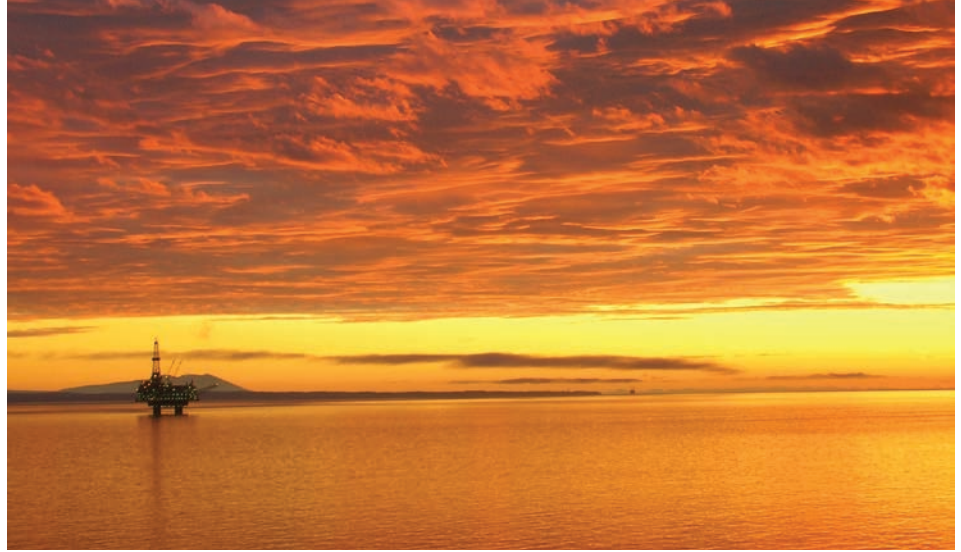
A coalition of Alaska groups are urging the Obama administration to retain three planned lease sales in the Chukchi and Beaufort seas, as well as Cook Inlet, pictured above.

Alaska's Arctic OCS constitutes one-third of the nation's reserves and one of the world's largest untapped resources, potentially reaching as high as 26 billion barrels of oil and 132 trillion cubic feet of natural gas. It would constitute the eighth largest oil resource in the world, ahead of