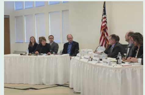
Alaskans participate at a U.S. Senate Energy and Natural Resources Committee hearing in Fairbanks this spring to share their insights on the best ways to overcome federal overreach.

The next steps will be to push to provide access to new areas, right alongside our efforts to promote energy innovation; to rethink the commercial environment in new offshore areas like the Arctic; and to address the implementation of regulatory systems