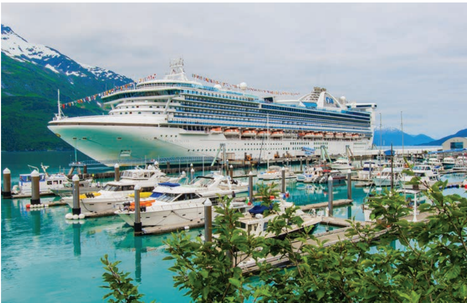
A Princess cruise ship arrives at the port in Whittier.