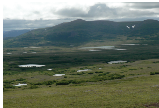
The Pebble prospect is 200 river miles north of Bristol Bay.

RDC's comments are available at akrdc.org .