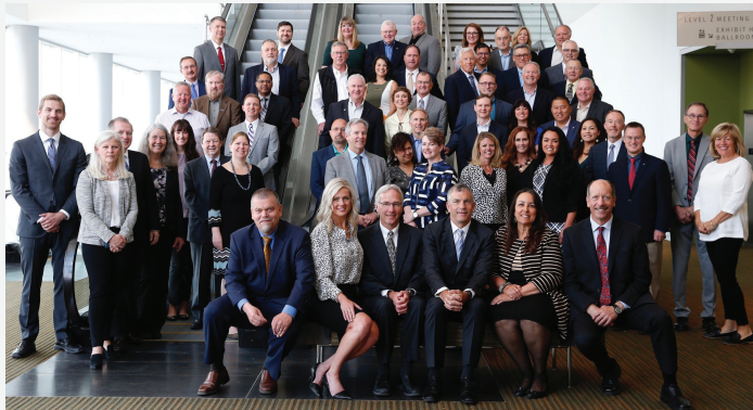
Members of the RDC Board of Directors