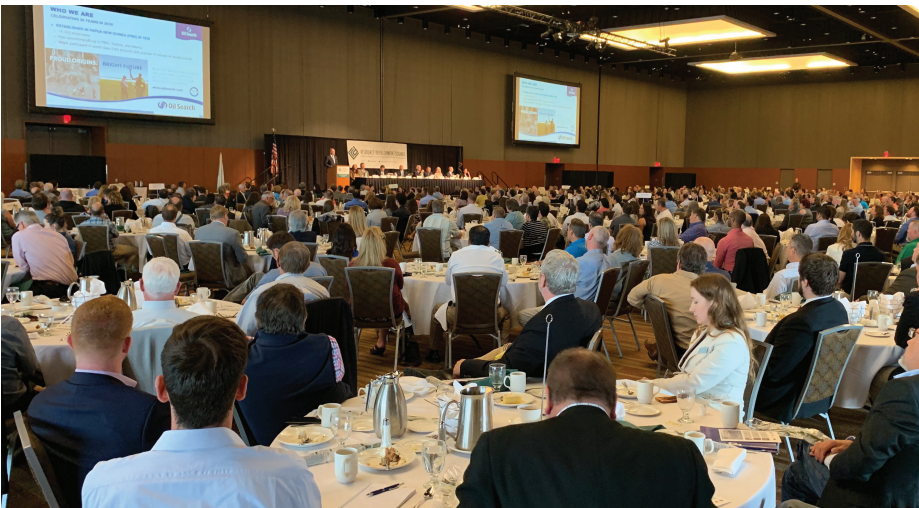
Approximately 700 people attended RDC's Annual Membership Luncheon at the Dena'ina Center in Anchorage last month. The event was sponsored by more than 100 companies representing all of Alaska's basic industries and economic sectors.