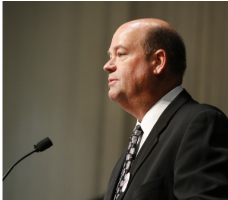
Ryan Lance speaking before the RDC Annual Meeting in June 2014.

anticipates ramping quickly to full production. Thereafter, it estimates that up to an additional $3 billion of cumulative drilling capital will be executed over multiple years to maintain production at this facility.