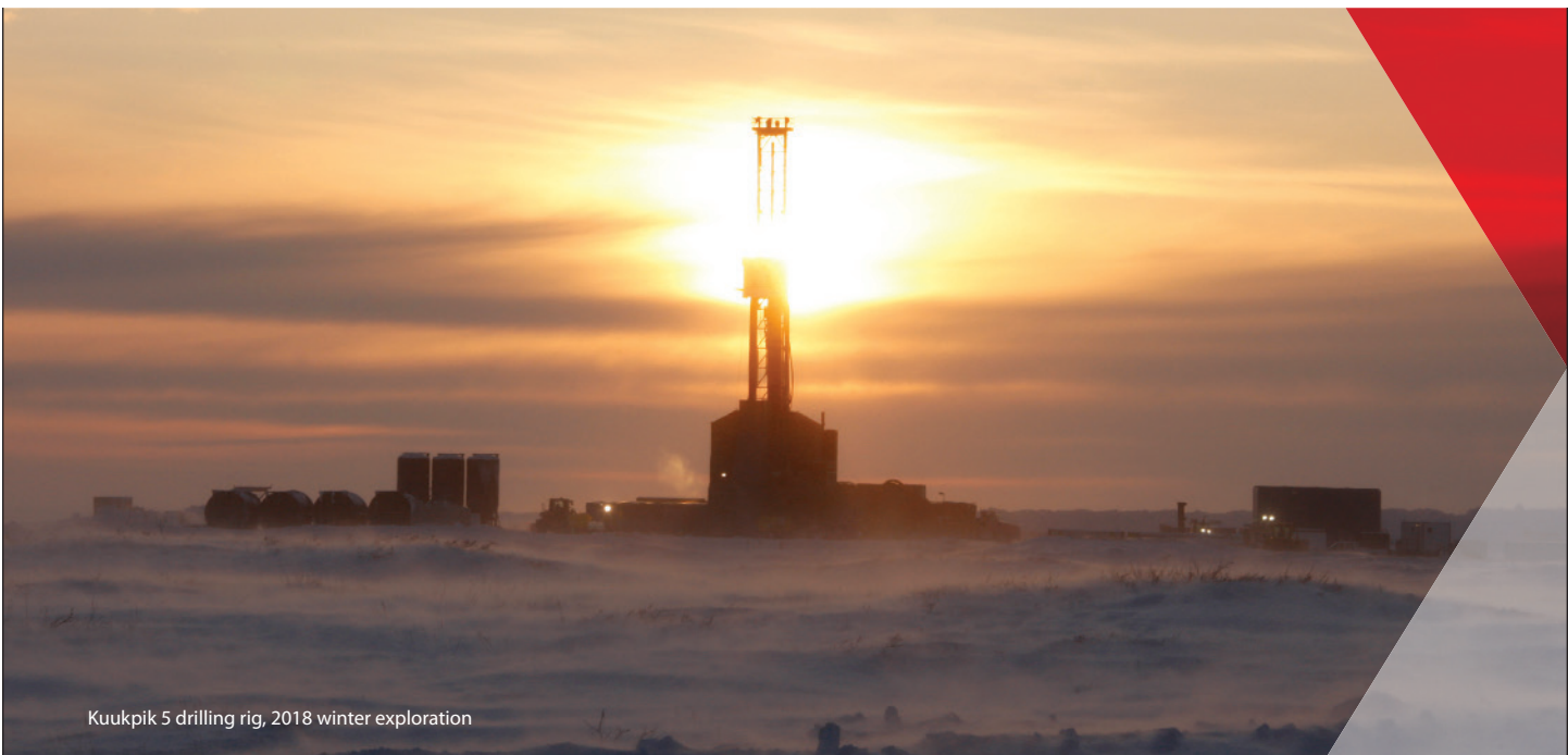
Kuukpik 5 drilling rig, 2018 winter exploration

PRSR STD U.S. Postage PAID Anchorage, AK Permit No. 377