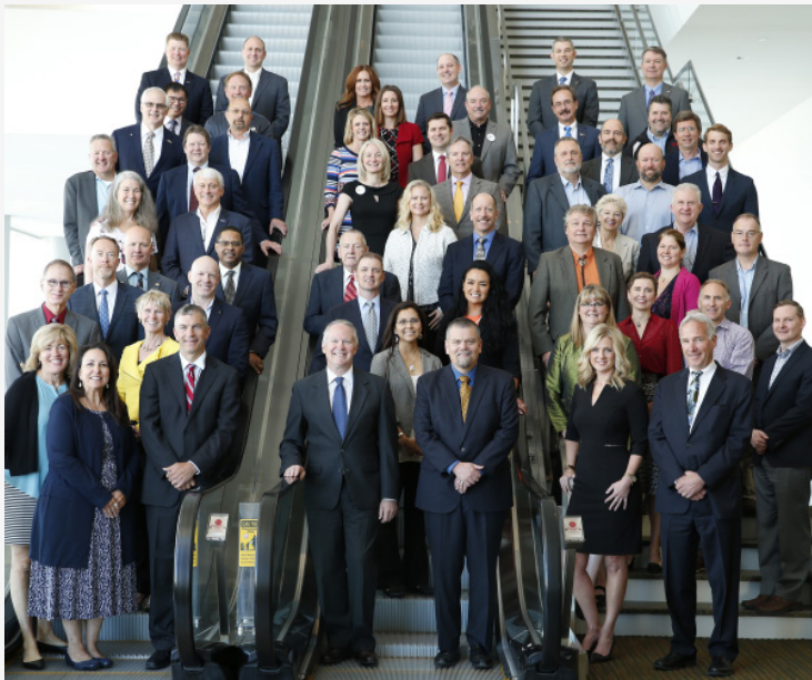
Members of the RDC Board of Directors