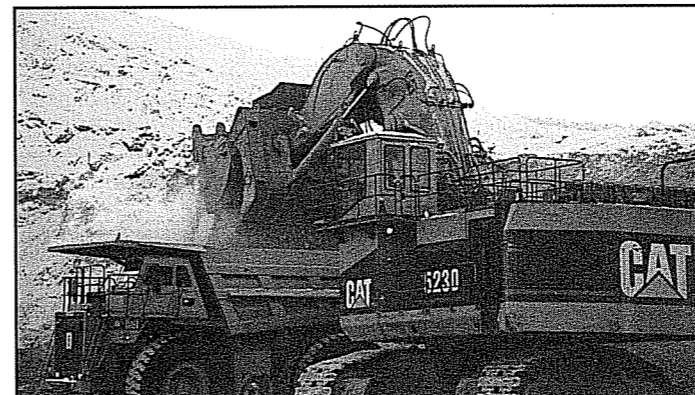
Heavy equipment working year-round digs the ore from an open pit and transports it to a crusher. A one-half mile conveyor belt then carries the crushed ore to the mill.

Thanks to the size of the deposits and the strength of the companies involved, those projects have moved forward.