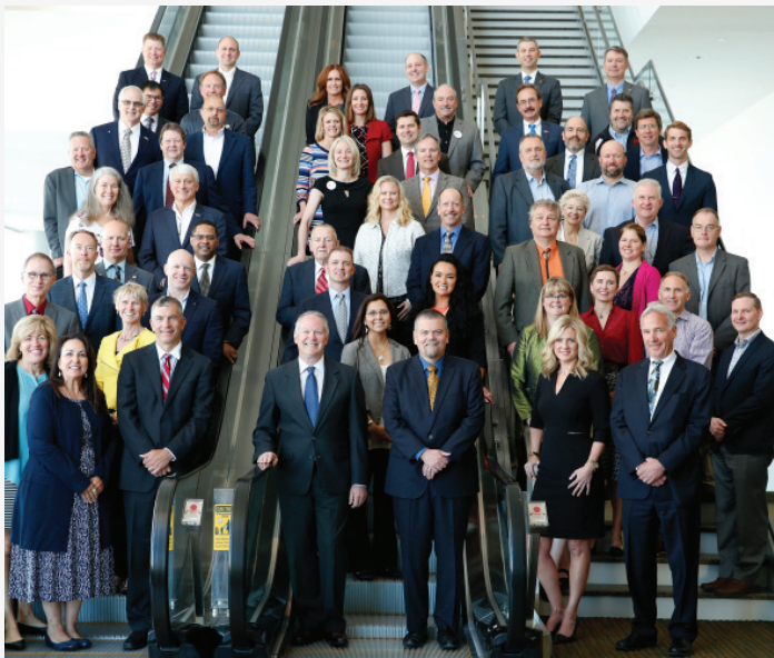
Members of the RDC Board of Directors