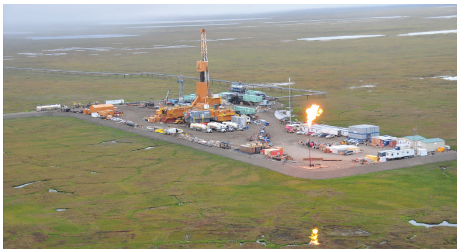
Above is the Greater Mooses Tooth field now producing oil in the 22 million-acre NPR-A.

The Bureau of Land Management has issued a notice of intent to prepare a new integrated management plan and associated environmental impact statement for the National Petroleum Reserve-Alaska.