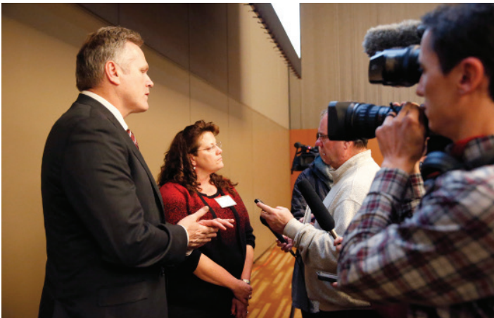
Declaring "Alaska is open for business," then Governor-elect Mike Dunleavy pledged the responsible development of Alaska's resources to grow Alaska's economy. Above Dunleavy and new Alaska Department of Natural Resources Commissioner Corri Feige address the press.