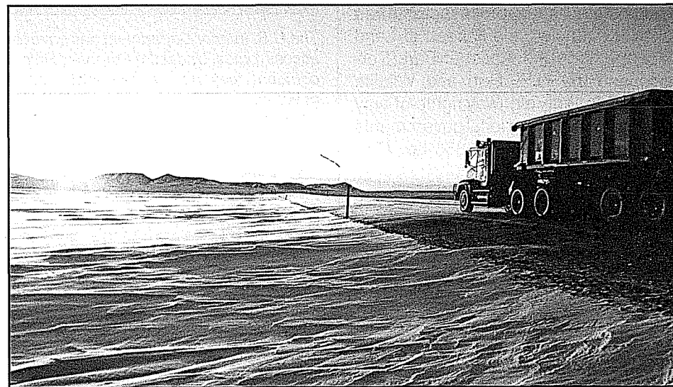
It took Congressional action to build a road from the Chukchi Sea to the Red Dog Mine in Northwest Alaska because the access route crossed Cape Krusenstern National Monument. Considering the complexity of Title XI, mine developers instead pursued a land exchange before Congress to build the road.