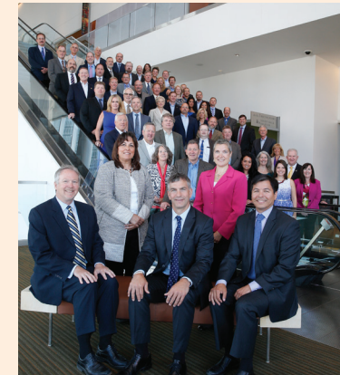
Sinclair Wilt Westward Seafoods, Inc. Anchorage